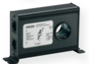
Steca PA HS200 Shunt